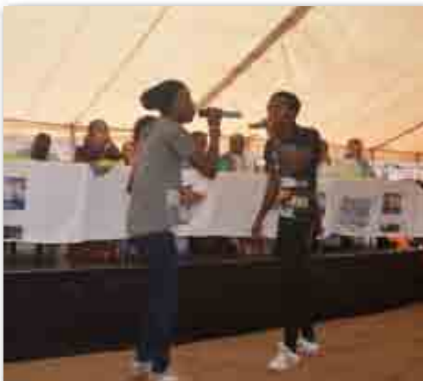
Learners through drama demonstrated the impact of poor indoor and outdoor air quality.