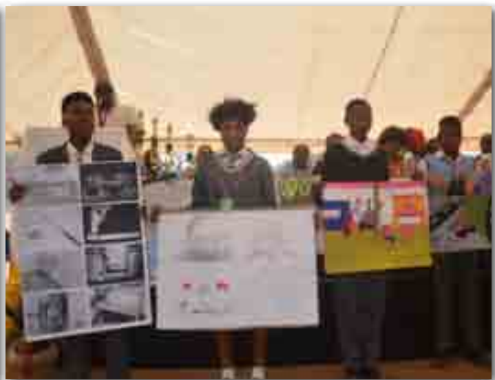
Art competition winners. The theme was "Indoor and Outdoor Air Quality".