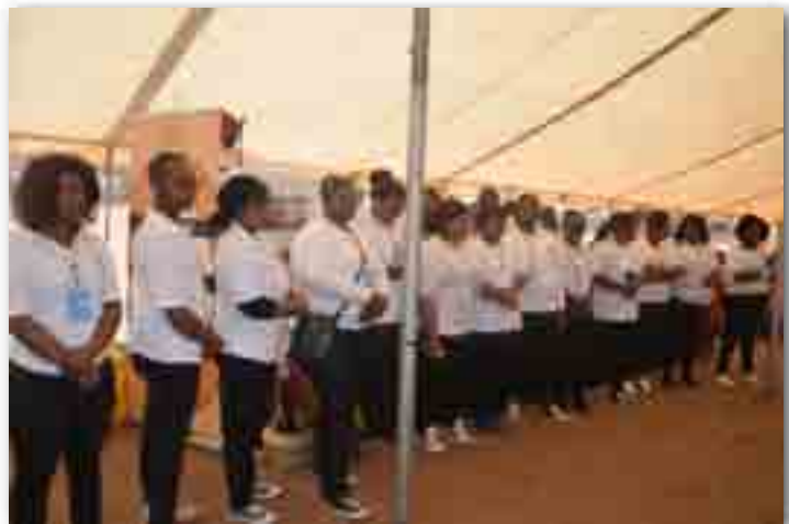
JGDM Environmental Health Practitioners at the World Environmental Health Day in Burgersdorp

Hundreds of school learners took part in the event. Prior to the event JGDM Municipal Health Workers visited schools to educate them on this year's theme "Indoor and Outdoor Air Quality". Learners were requested to create paintings of their environment and means of improving air quality. Forty pupils received certificates for participating in various art forms, depicting the influence of poor air quality on people.